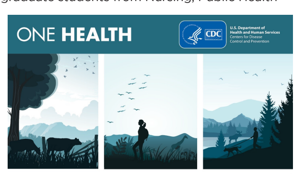
CONNECTING HUMAN, ANIMAL, AND ENVIRONMENTAL HEALTH

considers health from a perspective of human, animal. and environmental health.